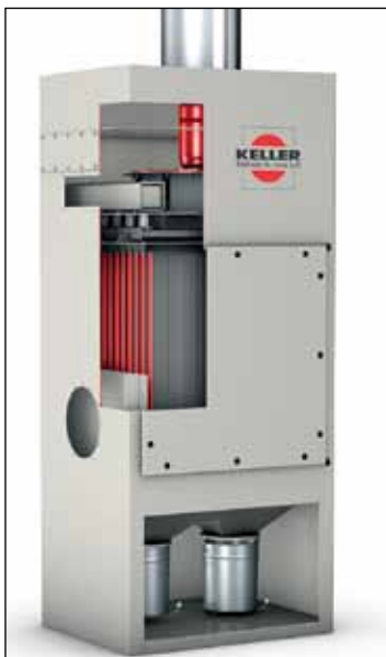
Keller VARIO eco dry separator

For VARIO eco dry separators, the KLR-Filter® exchange is made inside the dirty air zone.