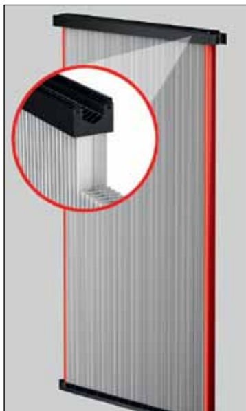
Sealing gasket for the filter plate is above the header