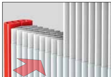
The diagram shows a KLR-bran filter including separation membrane

KLR-bran filters are equipped with a PTFE membrane to separate particulate. All configurations can be obtained with an IFA-M-test certificate for return air operation according to the DIN EN 60335-2-69 .