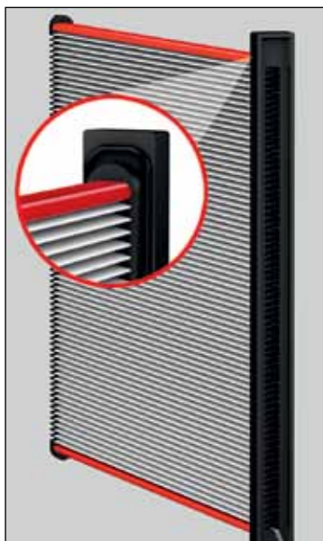
The sealing gasket for the filter plate is installed below the header