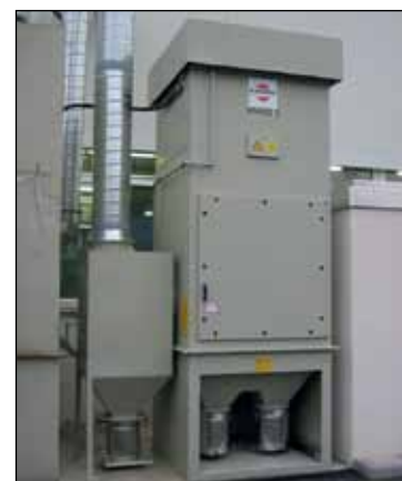
VARIO eco dry separator with exhaust air operation